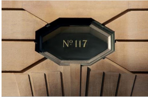
117 St Aldates Building